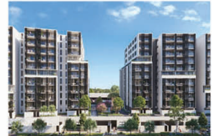
Evo Fairfield BC